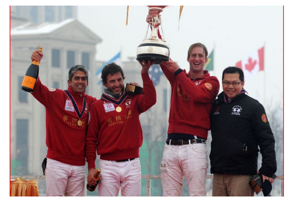
Winners 2nd FIP World Snow Polo Championships in Tianjin, China

and better as teams from twelve nations showcase their best efforts to take home the trophy. FIP joins with Fortune Heights, the Goldin Group, and Metropolitan Polo Club to make it one of the prestige tournaments for winter in the Northern Hemisphere.