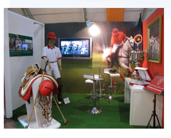
FIP in POLO EXHIBIT MOROCCO